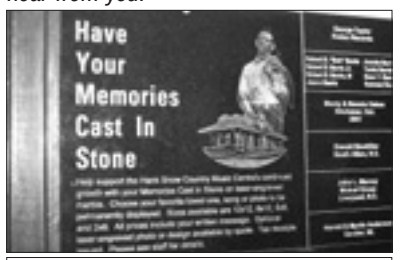
Photo of our Black Marble Plaque with some of the many names of donors who have already contributed

We are preparing a fundraising campaign for our expansion. The independent Feasibility Study has been completed and we need to move forward with the Business Plan. If there are any members who are interested in helping with the varying parts of this process, we'd love to hear from you.